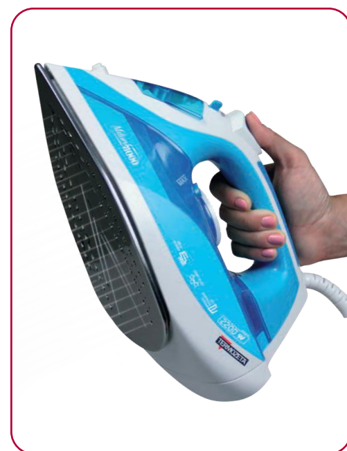
Piastra in ACCIAIO INOX