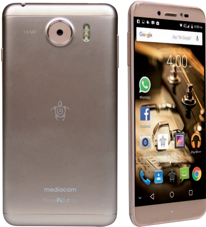
CODICE: M-PPAS532U - versione gold CODICE EAN: 8028153080801