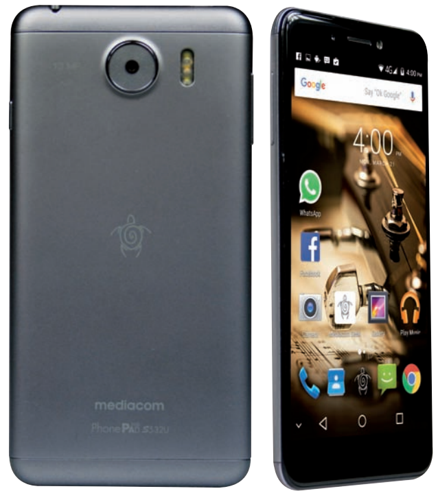
CODICE: M-PPBS532U - versione grey CODICE EAN: 8028153080818